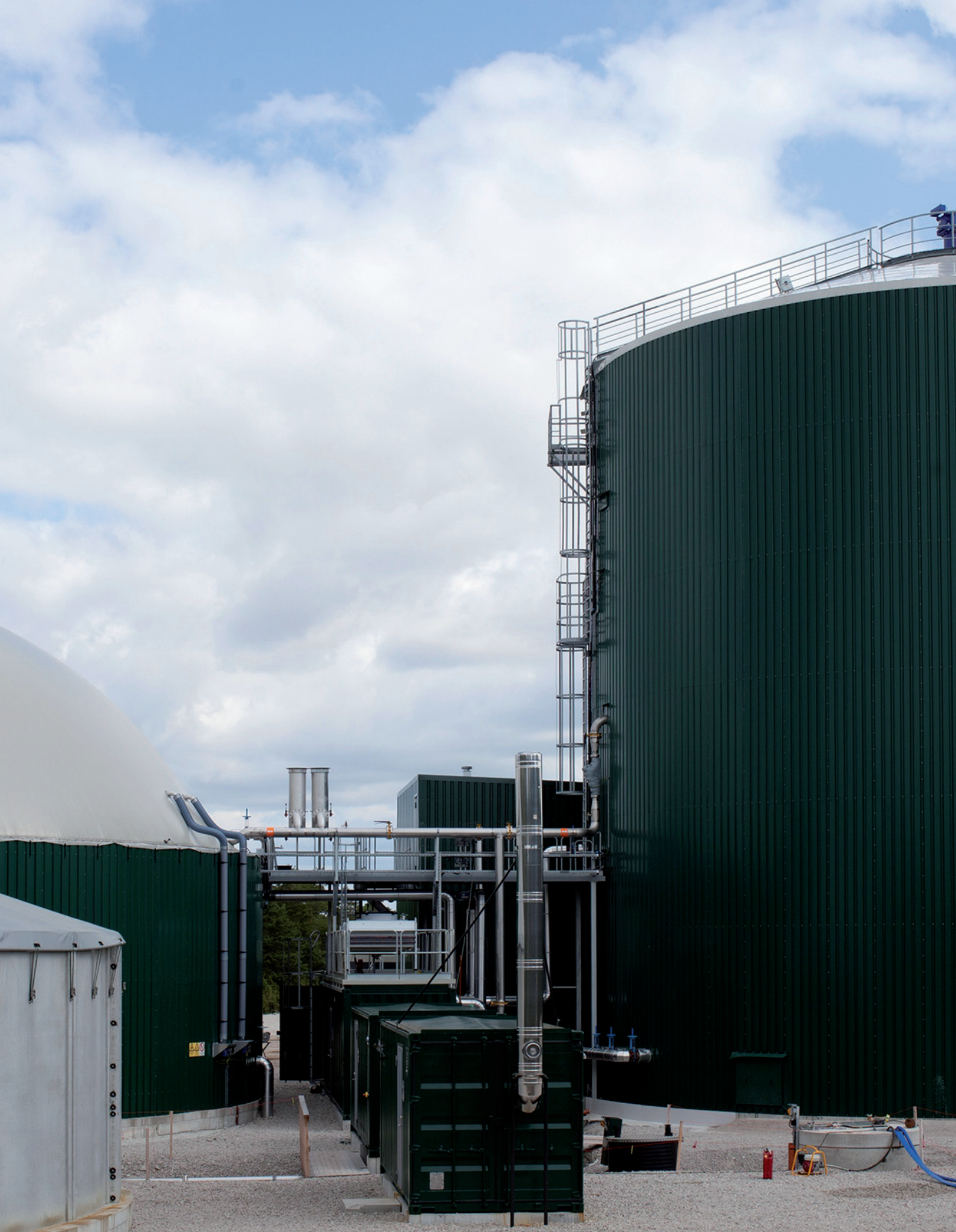
Farm-scale biogas plant. The photo shows the digester tank, containers and various equipment and installations for gas cleaning and management of the plant, the secondary digester tank, and a covered storage tank for digestate.