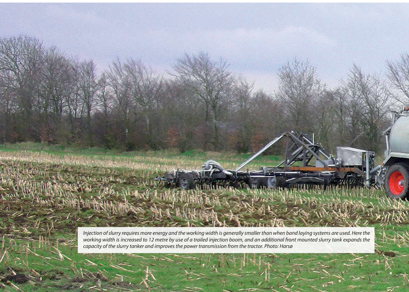
Injection of slurry requires more energy and the working width is generally smaller than when band laying systems are used. Here the working width is increased to 12 metre by use of a trailed injection boom, and an additional front mounted slurry tank expands the capacity of the slurry tanker and improves the power transmission from the tractor.

As a way to combat the abovementioned challenges that relate to livestock manure - environ-