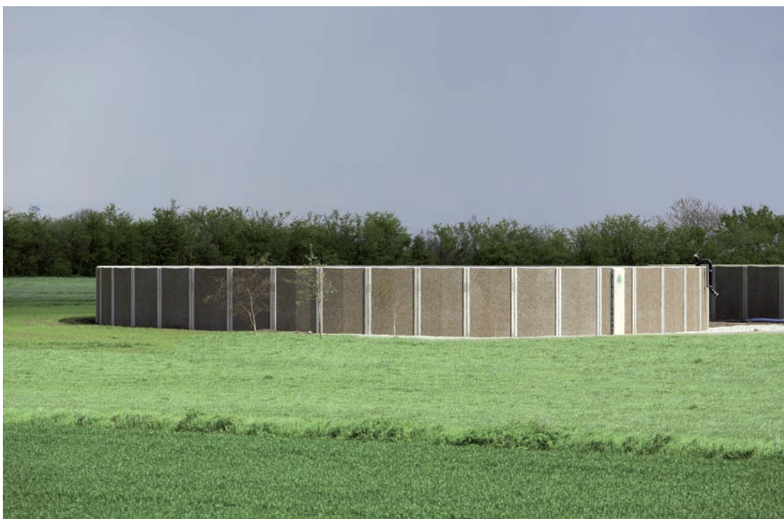
Danish legislation demands livestock farms to have a capacity to store slurry for a minimum of 9 months, calculated according official default values for manure production. Safe and sufficient storage of livestock manure is a pre-condition for good manure management – it preserves the livestock manure quality, and for slurry it enables the use as crop fertiliser in the springtime when the plants need the nutrients. The photo shows Agri-Tanken made in pre-fabricated concrete elements with lake stones surface.

ing. The goal is an overall reduction of greenhouse gas emissions in the EU of at least 20% below 1990-levels and an increased share of renewables in energy consumption by 20% by 2020, 20% higher energy efficiency, and 10% renewables in transport by 2020.