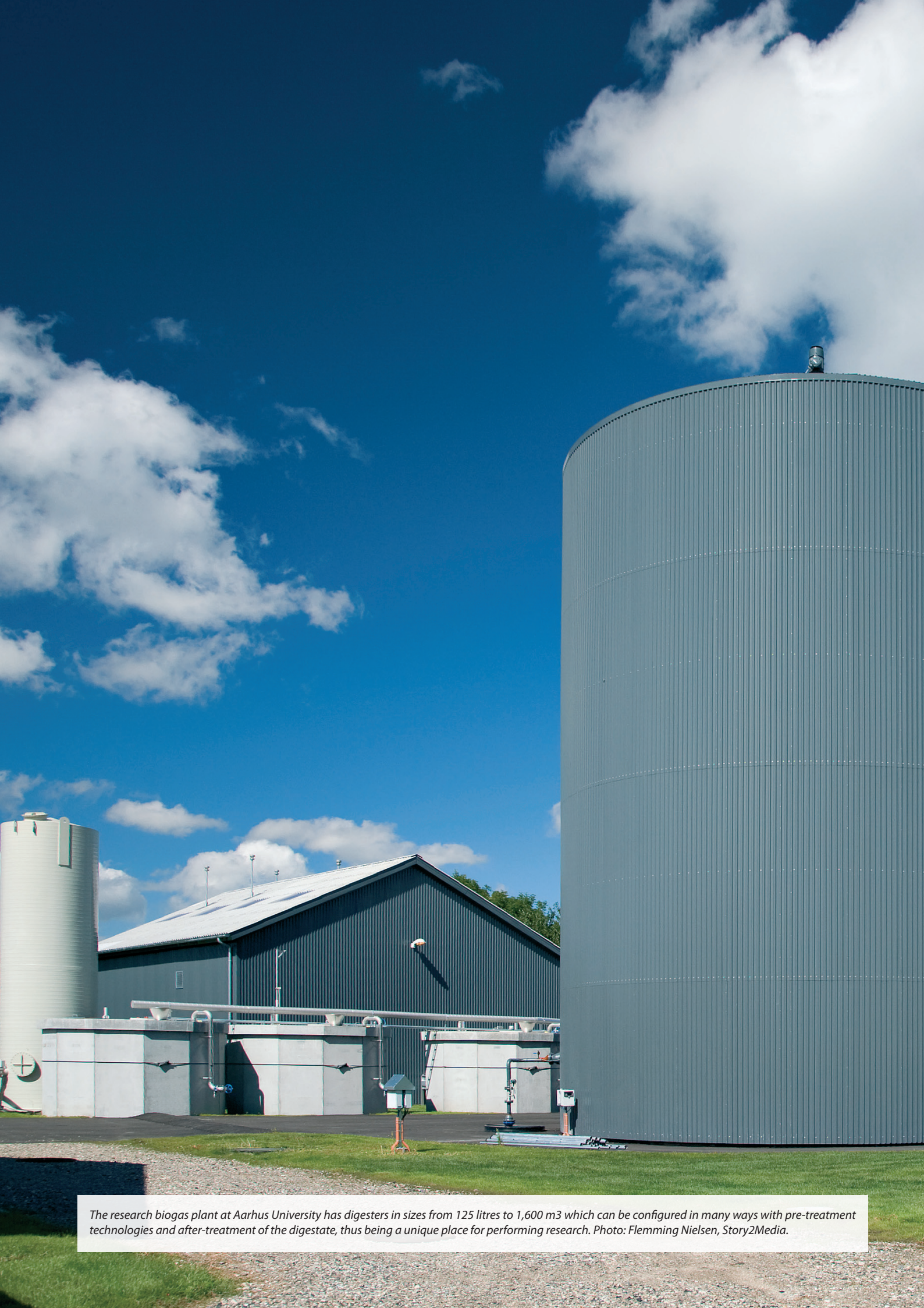
The research biogas plant at Aarhus University has digesters in sizes from 125 litres to 1,600 m 3 which can be configured in many ways with pre-treatment technologies and after-treatment of the digestate, thus being a unique place for performing research.