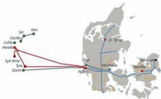
Figur 2: The backbone of Denmark's natural gas grid consists of 860 km national gas pipes, a gas store and 46 regulation stations. The grid is connected to regional and local gas pipes.

The upgrading process is basically a separation of the biogas' content of 55-70% methane ( \text{CH}_4 ) from its unwanted content of 30-45% carbon dioxide ( \text{CO}_2 ), plus a small content of ammonia ( \text{NH}_3 ), hydrogen sulphide ( \text{H}_2\text{S} ) and hydrogen ( \text{H}_2 ). The process raises the biogas' methane content to about 98% according to applicable standards while it is energy adjusted by use of a little propane and compressed to at least 200 bar.