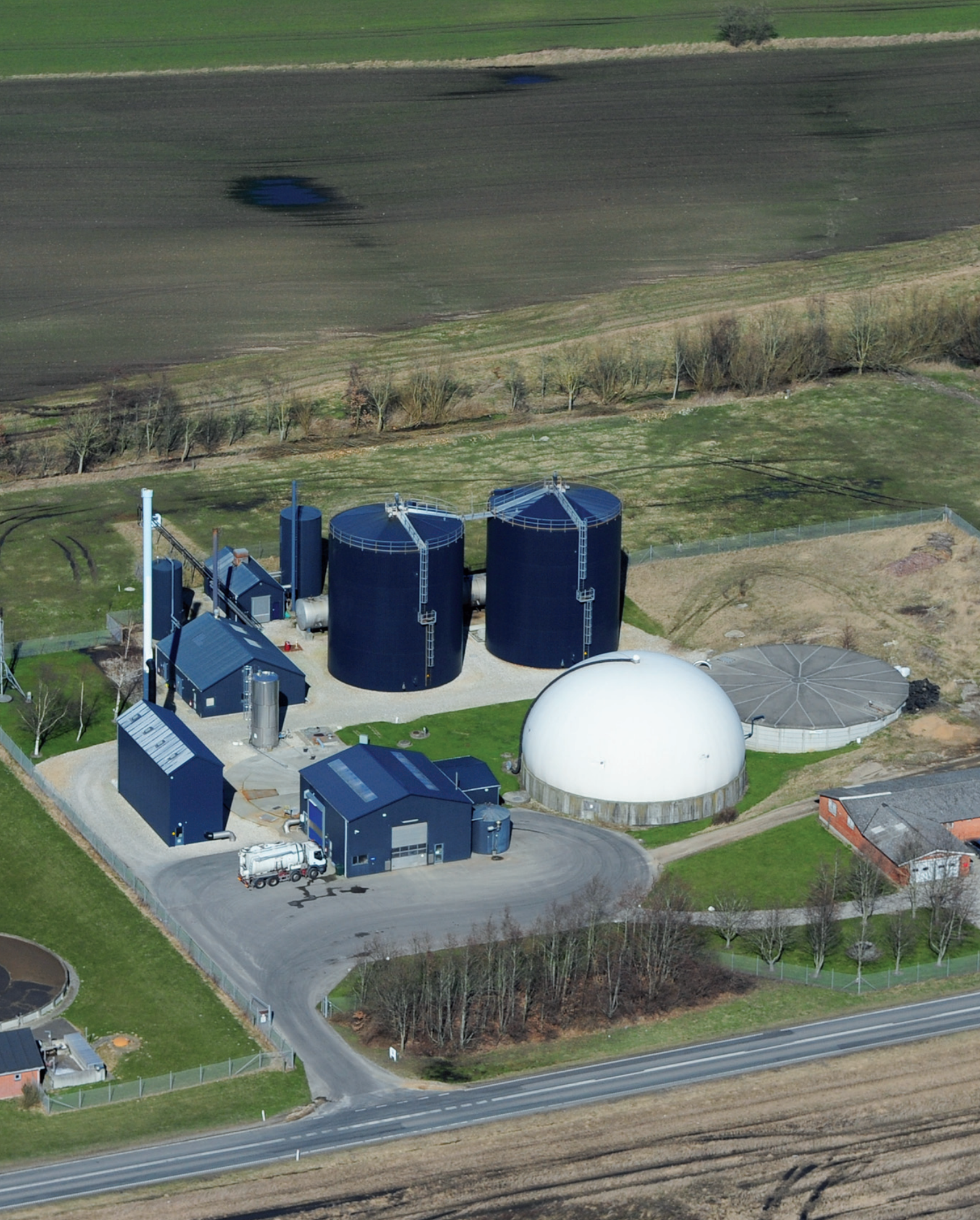
Thorsø Biogas is an industrial scale biogas plant treating around 120,000 ton substrate per year, of which approx. 65% livestock manure that is delivered from 60 farms nearby, 35% stomach content, sludge and other organic wastes from food processing at a dairy and a slaughterhouse, and a little waste water treatment sludge. The anaerobic digestion happens at thermophile temperature. Around 30% of the digestate is re-distributed to crop farmers, while the rest goes back to the supplying livestock farmers. The gas is via a pipeline to the nearby Thorsø village used for climate friendly district heating.